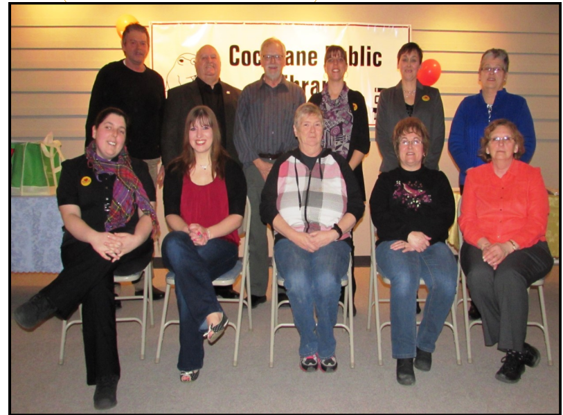
Volunteer Appreciation Night 2014

VOLUNTEER!!! Be a part of our team... No library experience required!